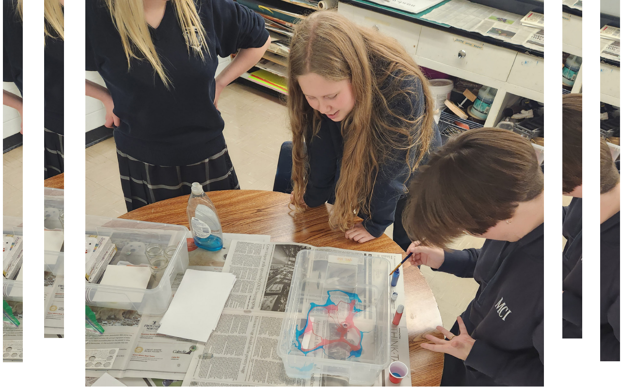
MCI students creating Suminigashi/paper marbling in Art class