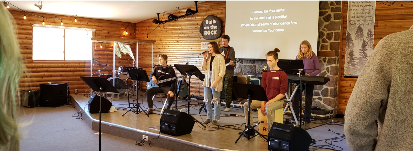
Singing time at Red Rock Bible Camp for the Christian Life Retreat